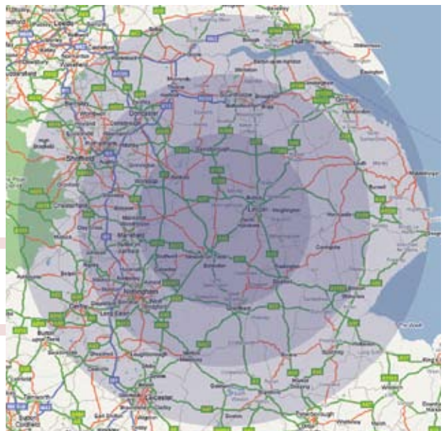
Crane Hire - Area we cover

A Contract Lift is where we will plan the lift, select a suitable crane, specify the slinging and signalling arrangements, supervise the lift and are responsible for the lifting operation, including the production of a Method Statement, Risk Assessment and Lift Plan. We also supply full contract lift insurance which covers on hook insurance up to a value of £70,000. (Extra on hook insurance can be arranged to suit the value of the goods being lifted.)